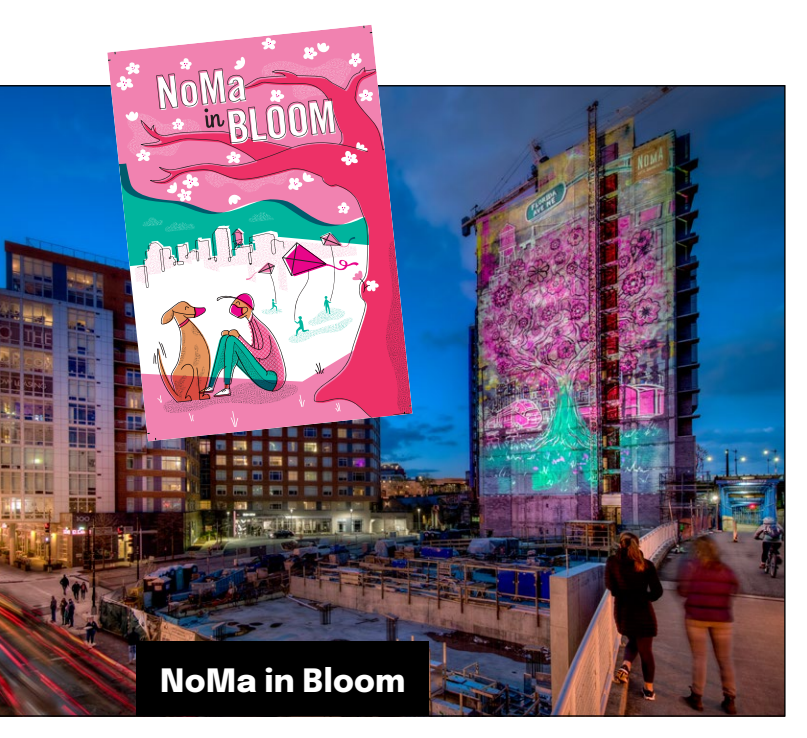
A giant pop-up light projection celebrating the arrival of cherry blossom season.

Following all public health guidelines, the BID successfully launched a robust lineup of in-person, outdoor, large-scale events, injecting fun and community back into everyone's calendar. These free gatherings, together with BID-sponsored virtual events, attracted more than 6,000 participants, and provided significant patronage to NoMa restaurants and local food truck vendors.